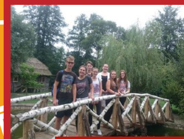
Etno Village Kotromanicevo, Dobo