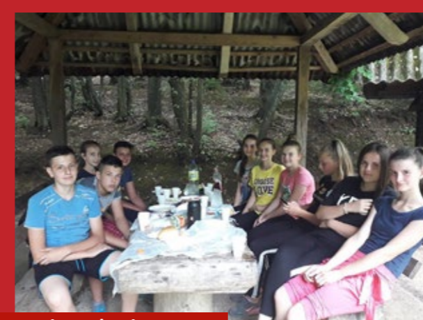
Kacuni – a day in nature