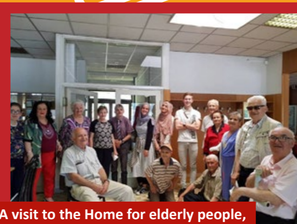
A visit to the Home for elderly people, Nedzarici, Sarajevo